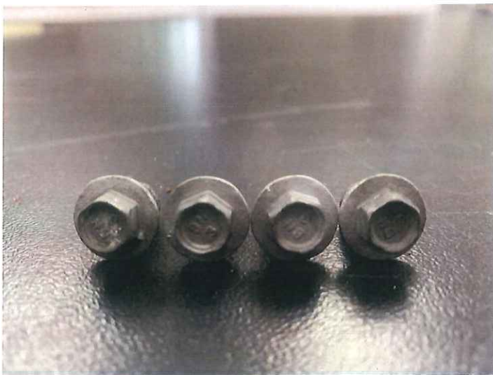
Fig. 3 : After test