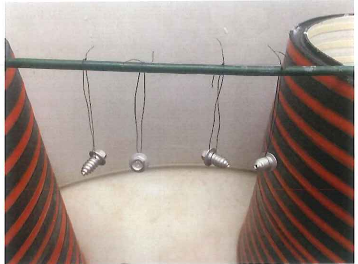
Fig. 2 : Method of supporting specimens