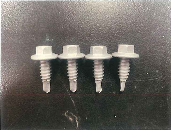
Fig. 1 : Received samples